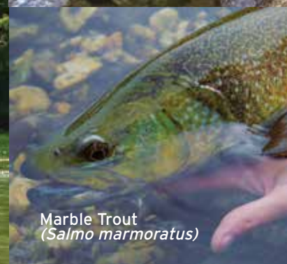
Marble Trout ( Salmo marmoratus )