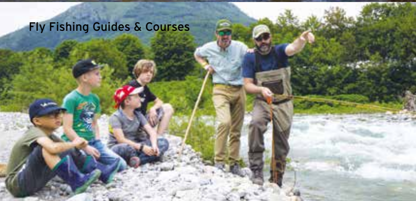
Fly Fishing Guides & Courses

Where the Royals once had their exclusive “hunting and fishing garden”, today you can enjoy a beautiful and exclusive Fly Fishing area called “LA REGINA DELLE MERAVIGLIE - REINE DES MERVEILLES”, where every outdoor lover and passionate Fly Fisherman will have the opportunity to flyfish and experience unique hikes and Fly Fishing. Crystal clear waters, surrounded by mountain peaks and snowfields, simply breathtaking views and rich microfaunas in intact river environments, characterize the area between Italy and France. The water levels are constant all year round, the rivers and the alpine lakes constitute the beautiful home of a significant population of marble trout, brownies and rainbows. A wide ongoing project about local trout development and the re-introduction of the typical northern italian plain grayling. A Natural Alpine Park with an historical and traditional tourist accommodation, a natural hot springs site called “Terme di Valdieri” characterize the italian mountainside and the unique and world wild well-known “Vallée des Merveilles” located in the Mercantour National Park on the French mountainside make these places a perfect destination for the fly fishermen of all around the world together with their families.