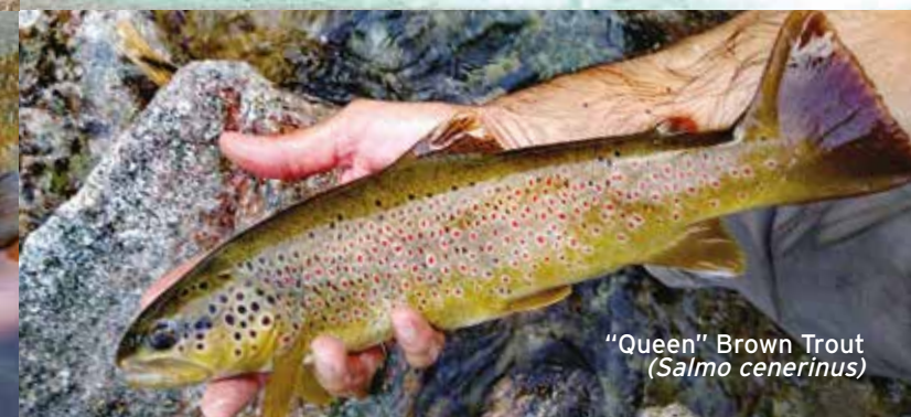
“Queen” Brown Trout ( Salmo cenerinus )