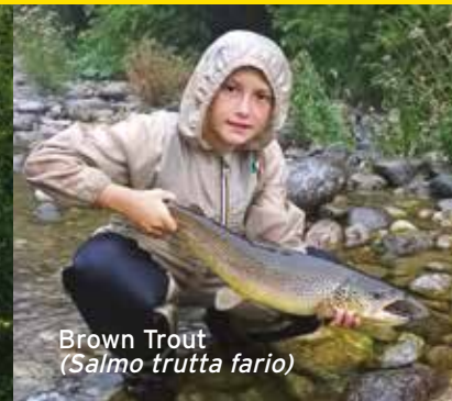
Brown Trout ( Salmo trutta fario )