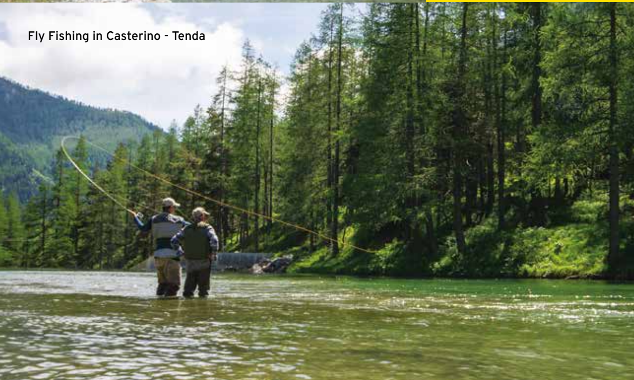
Fly Fishing in Casterino - Tenda