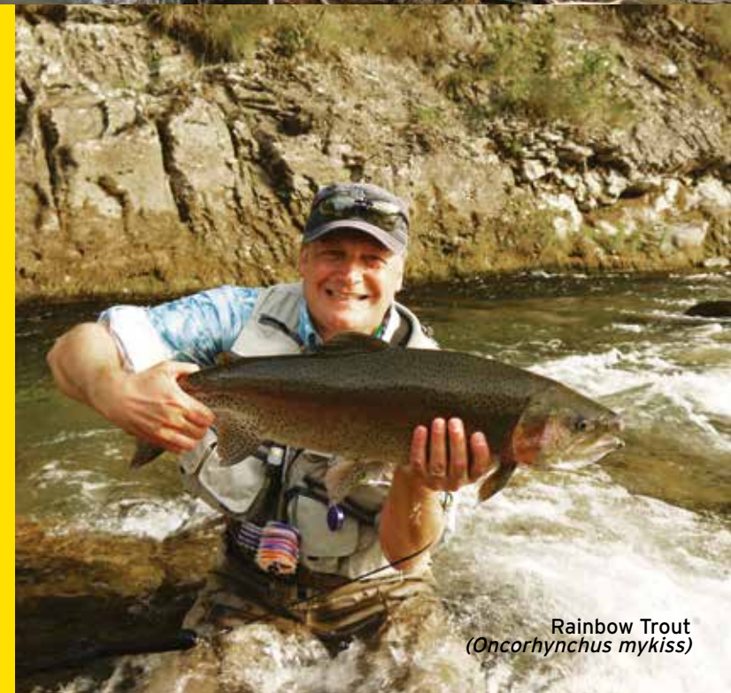
Rainbow Trout ( Oncorhynchus mykiss )