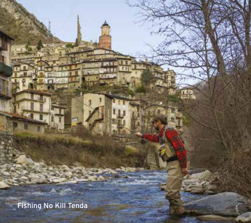
Fishing No Kill Tenda