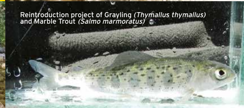
Reintroduction project of Grayling ( Thymallus thymallus ) and Marble Trout ( Salmo marmoratus )