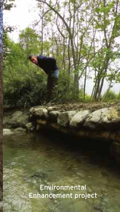
Environmental Enhancement project